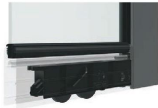
Alspec's high performance, commercial door roller used in the Carinya residential sliding door for smooth operation.