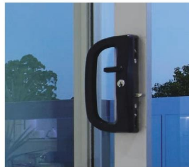
Functional and stylish Dual Point Yarra Curve door lock. Yarra Edge door lock with optional stylish colours also available.