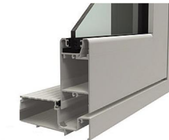
Carinya 92mm Hinged Door Sill Detail

The entire Carinya Collection has been fully tested to meet or exceed Australian Standards AS2047, AS1170, AS1191 and AS3959.