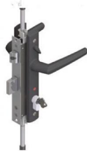
Exclusive Killara furniture with 4 point locking and snib release

The Carinya attention to detail includes concealed flush bolt brackets, reducing visible fixings, as well as custom extrusion design allowing for clean interaction with door hardware. The Centor hardware is of the highest quality which is backed by a 10 year warranty.