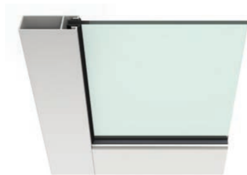
58mm wide rails and stile.

The entire Carinya Collection has been fully tested to meet or exceed Australian Standards AS2047, AS1170, AS1191 and AS3959.